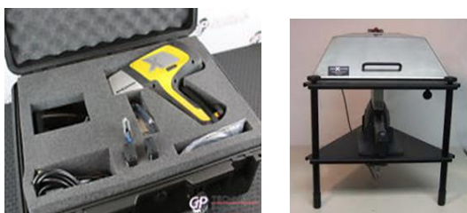
Fig. 5. X-ray Spectrophotometer The chemical elements detected in the soil samples are shown in Table 1

Determination of the chemical composition of the soil was carried out as follows: the soil samples were crushed in a crucible and then inserted into the X-ray Spectrometer (Fig. 5).