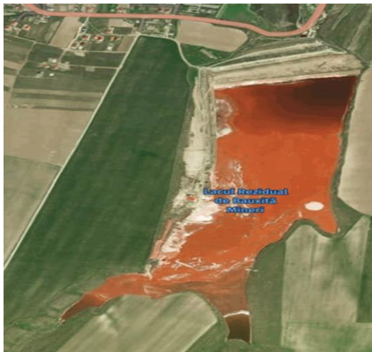
Fig. 1. Residual bauxite lake "Minerii"- Tulcea

We used soil samples taken from the area of the residual bauxite lake Minerii in Tulcea, as well as adjacent soil samples from the agricultural area to determine the pH and the chemical composition.