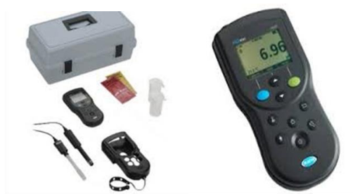
Fig. 2. Multi-parameter HQ40d

In the laboratory of the faculty, the pH was determined for the soil samples taken from the lake and the agricultural area in the lake using a HQ40d type multi-parameter (Fig. 2)