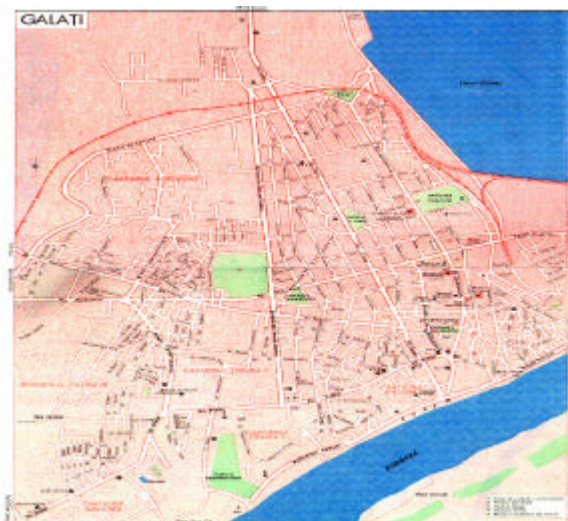
Fig.1. The urban area of Galati: the end-point of photochemical pollutants prediction.

where there are no measurements, as well as to be distributed to local authorities, and local radio and TV stations, in order to make announcements to the public and take preventive actions.