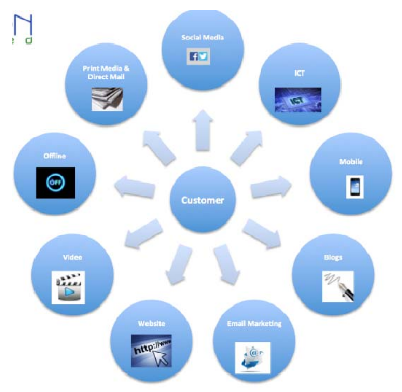
Figure 1. The breadth of marketing & communications channels

In this contemporary economy, marketing has taken a turn. Companies have changed the way that they're marketing and engaging with their audience and the 4 P's transform to the 4 E's of inbound marketing.